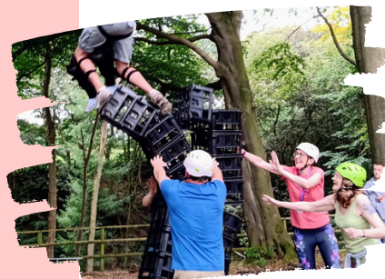
Practicing our balancing skills