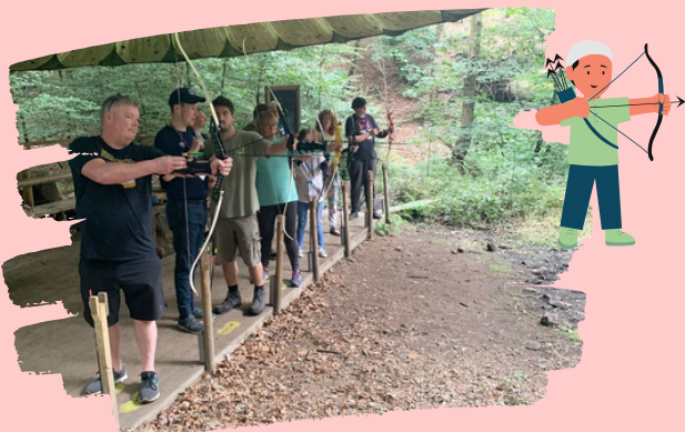
Some very talented archers!